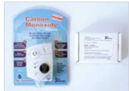
The SF350EN is available in a blister pack or trade box.